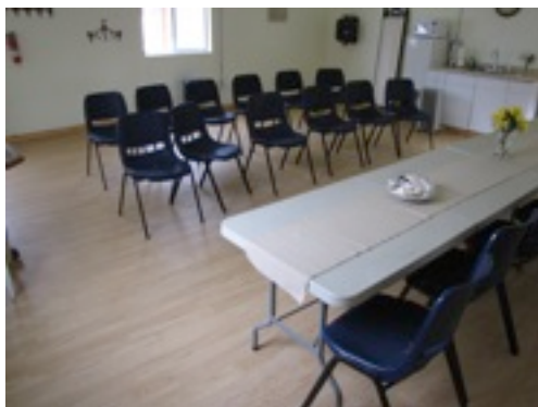
Community room set up for a meeting.

Since the monthly board meetings are held here, all the more reason for you to come down and take a look. The second Monday of every month we’re here, keep an eye out for a notice on the mailboxes.