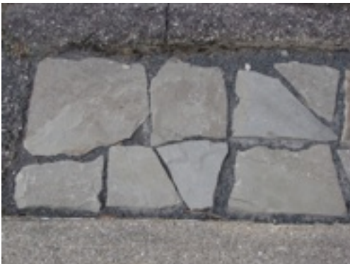
A close-up of the new stone work.

Be careful not to do too much walking on them, however, as they’re not as even and smooth as the sidewalk is!